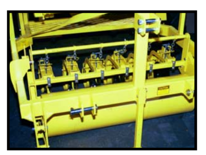
Front Packer and Ground Opener